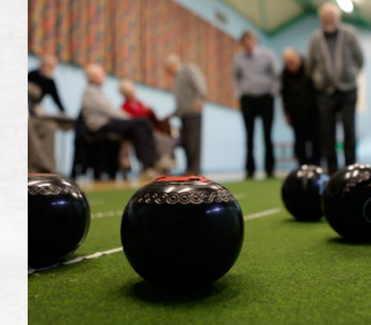
Ballyoran Community Centre, Ballyoran.