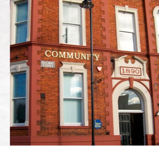
Bridge Community Centre, Lisburn.

A list of all Community Centres can be found on www.lisburncastlereagh.gov.uk as well as the Pricing Policy for room hire enquiries.