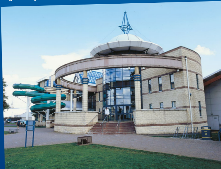
Lagan Valley LeisurePlex, Lisburn.

For a complete list of prices for Leisure Facilities in the Lisburn & Castlereagh City Council Area please go to www.lisburncastlereagh.gov.uk