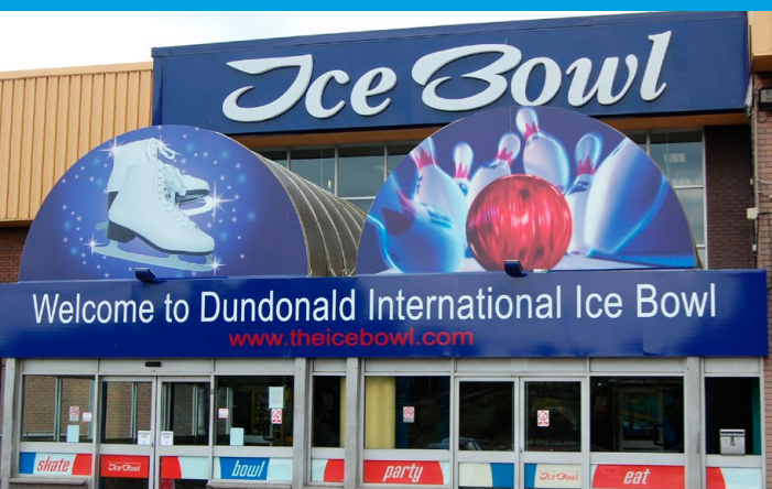
Dundonald International Ice Bowl, Dundonald.

One of the most complicated aspects of the two Councils joining together is the merging of their different pricing systems. We appreciate that charging and pricing are extremely important to our residents and much work has already been completed in this area.