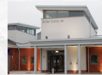
Enler Community Centre, Dundonald.