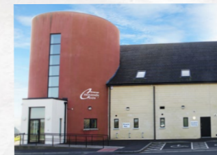
Moneyreagh Community Centre, Moneyreagh.